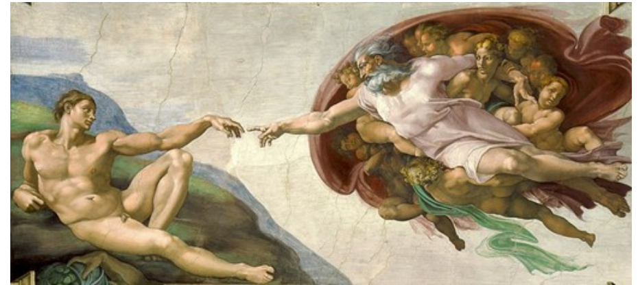
The Creation of Adam—Sistine Chapel

Created and administered by Christians Against Poverty. Registered Charity No. 1097217